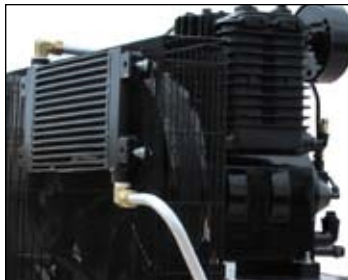
Air cooled after cooler Elite unit